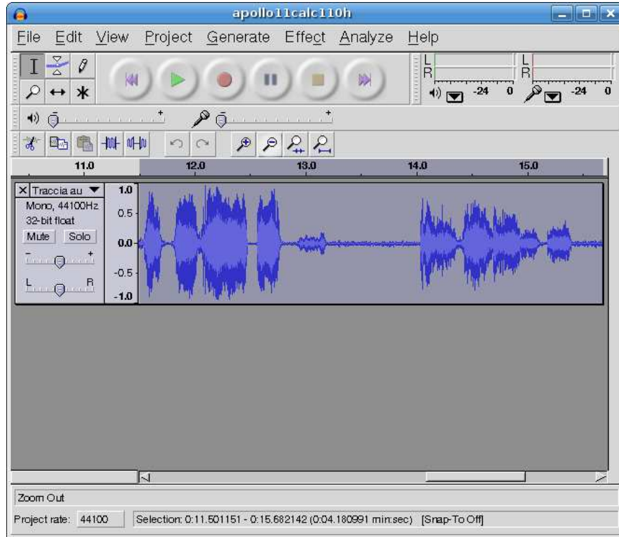
FIG. 1: Audio output of the words “... Houston, AOS, over”, as displayed using the opensource software Audacity 6 ; the pattern clearly reveals the echo effect. The small signal at about 13 s is a beep (“Quindar tone”) used to trigger ground station transmitters. The time scale can be arbitrarily expanded allowing an accurate determination of the echo delay.

Several methods of measurement of the time delay of the echo can be adopted and the students were given freedom to devise the more appropriate one: some chose to mark the times at the beginning or at the end of the syllables, others at the maximum of the signal within a syllable. Each measurement has an associated uncertainty, that the students were asked to estimate as well. For instance, the duration of a syllable and of its echo can be measured, and the difference be taken as an estimate of the uncertainty. Specifically, four groups chose to use the beginning of the word “over”, three the end of the same word, and three the maximum of the audio signal within the word, the uncertainties associated to the latter method being however substantially larger. As a final result, without affording a thorough statistical analysis, students agreed to take the average of the 10 measurements with the maximum shift from average as uncertainty, \Delta t = (2.620 \pm 0.007) s. This translates into d_{EM} = (3.93 \pm 0.01) \cdot 10^8 m, quite an accurate measurement. The above error estimate is